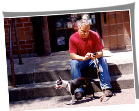
Figure 3. Persona Mark